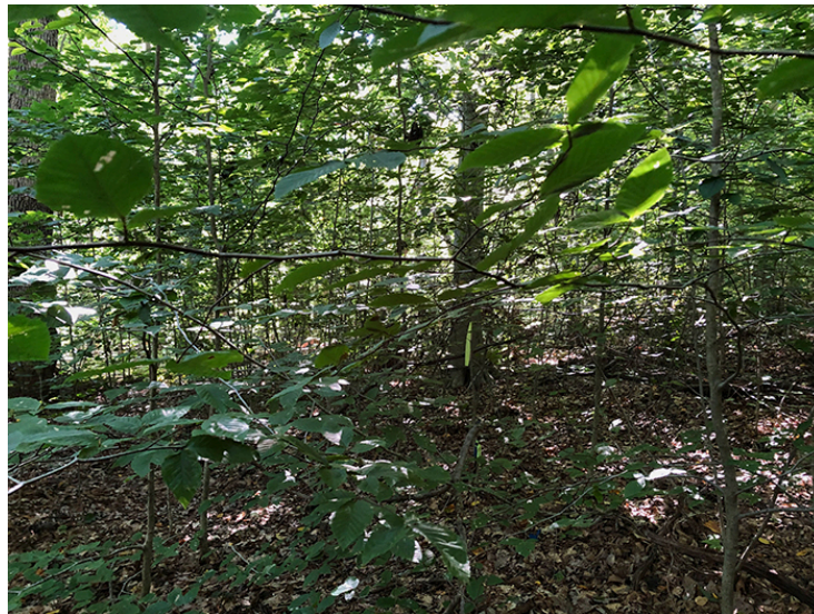
Figure 6. An unaffected mature beech among a dense stand of clonal saplings.

American beech is a long-lived (300–400 years), late successional species of climax forest types. It grows in the shade of mid-succession trees, provides deep shade at maturity, and inhibits growth of earlier succession flora as well as invasive plants. In New Jersey, beech occurs as late succession species in two major forest types, oak-hickory and northern hardwoods. For decades beech served as the last stronghold to maintain climax forest conditions as Eastern hemlock ( Tsuga canadensis ) populations declined due to invasive insects, while the range of sugar maple ( Acer saccharum ) and yellow birch ( Betula alleghaniensis ) transitions northward with climate change. The projected loss of beech due to BLD will shorten forest succession timelines by hundreds of years and enable an increased rate of disturbance cycles. The beech-dominated and associated climax forest condition will become diminished along with forest quality and ecosystem balance.