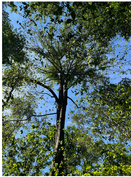
Figure 5. Advanced beech leaf disease progression exhibited as defoliation of beech leaves, which usually occurs from the lower canopy upwards.