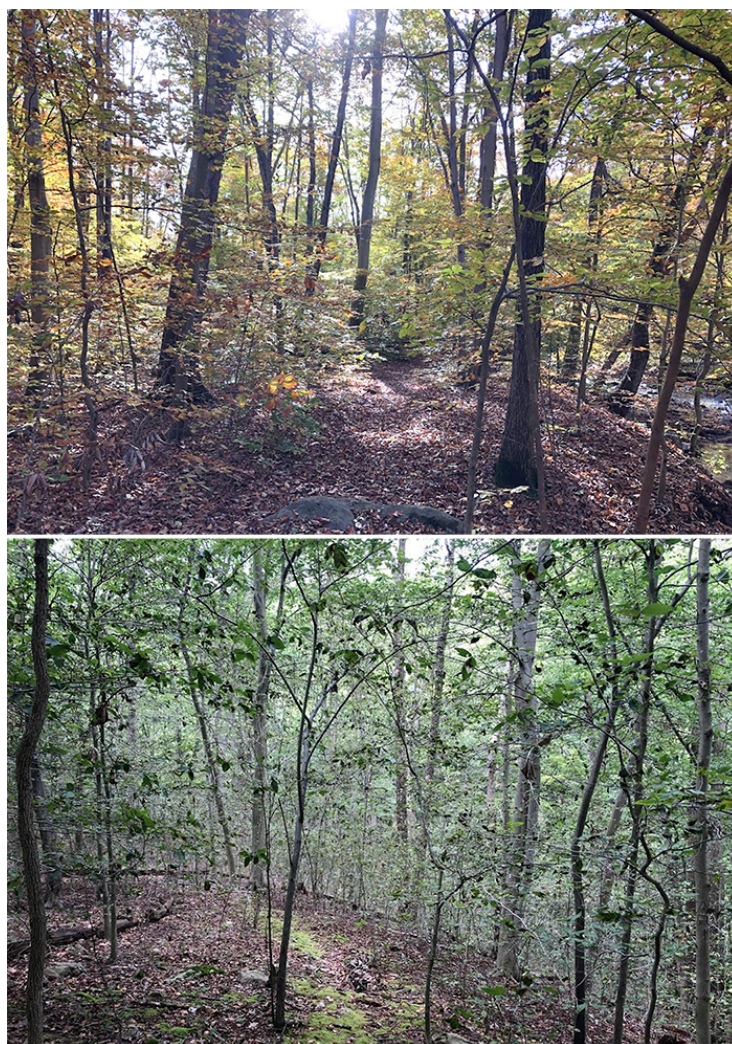
Figure 4. Visual difference between beech leaf disease infection from 2021 with <1% infected leaves (top), to 2022 with >50% infected leaves in the lower canopy (bottom), within the same American beech forest of Morristown National Historical Park, NJ.

Yale researchers found that thickened infected leaves have increased mass while they have decreased photosynthetic ability, stomatal conductance, and stomatal density. Therefore, infected leaves require more resources to sustain their mass, but have decreased function to photosynthesize and produce those resources. This dysfunction contributes to the mechanisms that cause rapid tree decline and demonstrates how affected beech essentially become starved of photosynthetic resources.