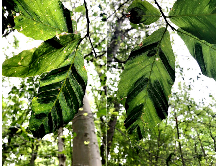
Figure 2. Symptomatic beech leaves afflicted with beech leaf disease. These photos are taken against the light sky to show the opaque banding of diseased leaf tissue, an indicative symptom of BLD.